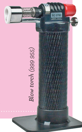
Blow torch (999 955)

A Silver chain of your choice (in the example we use VVC FHA)