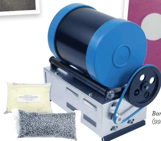
Barrelling Starter Kit (999 600k)