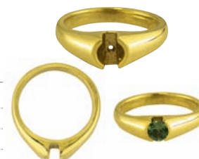
Example set with stone